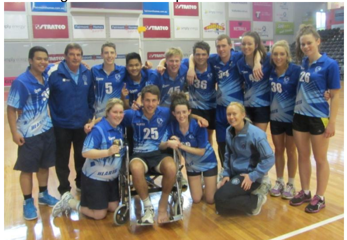
SA High School Champions Sacred Heart College.